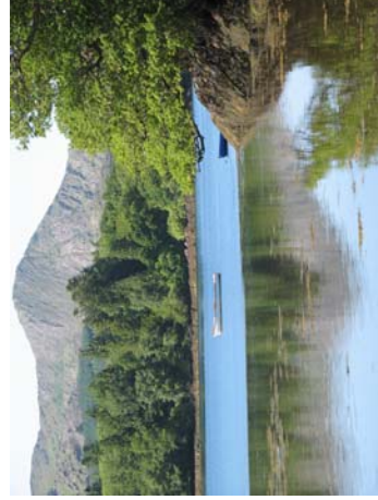
Derreen Gardens, Lauragh, Beara Peninsula, Co. Kerry

While in Neidin (Old Irish for Kenmare) we will visit the rugged Ring of Beara to the south. We will see ancient ring forts, standing stones, colourful villages, lush semi-tropical gardens, ocean views and more. We will take a day trip to Dingle Peninsula, touring Dunbeg Fort, Gallorus Oratory & Dingle Town. There will be ample time to visit the many fine shoppes, markets and quaint pubs and restaurants located in Kenmare. We will have our own musician on board with Fintan Malone, who will be joined by Corkman Liam O’Riordan for our evening entertainment.