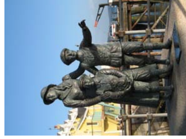
Annie Moore statue located on the pier at Cobh., Co. Cork

In the evenings we will go into Kinsale for nightly doses of entertainment, pub craic and fine pints of Murphy’s (when in Cork, do as the Corkonians do and drink Murphy’s). And again, we will have our own musicians to keep us well entertained in the evenings.